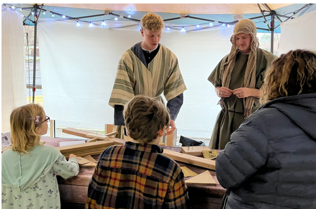
JOURNEY TO BETHLEHEM