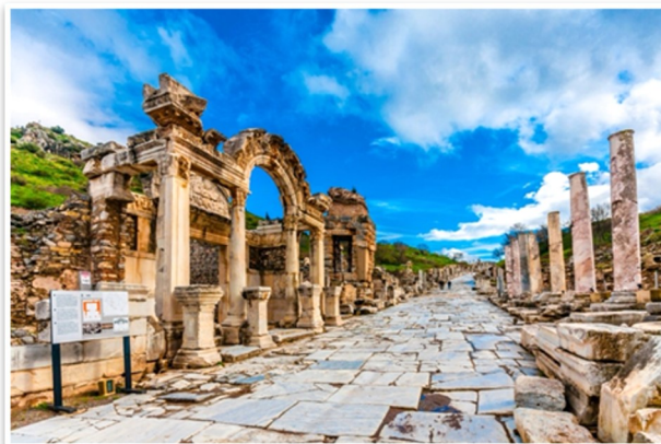
The main street in ancient Ephesus