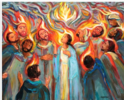
'The Day of Pentecost' by Jen Norton

I think it's an exciting way for me to go out by using Acts to think