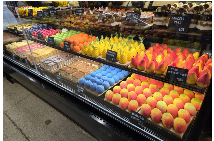
April's Trip was to the Emish Market in Fife.