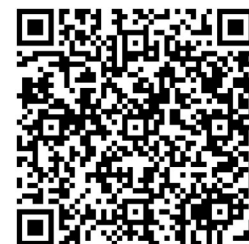
Latchkey Wish List

Latchkey has 25 kids signed up for their all day summer program. Very exciting! If you would like to offer them some support to their program, they have put together a WISH LIST on Amazon and you can purchase an item and send it to them as a gift! Thank you for supporting this great ministry of our church, supporting families in our local neighborhood!