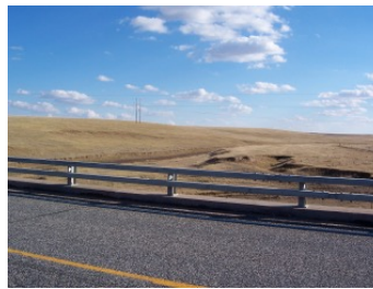
Bridge over Small Creek on U.S. Highway 36 east of London, Colorado.

Church Bridge is a fun filled evening of conversation with friends while playing a few rounds of cards. Finger food, wine and other beverages are enjoyed between rounds. Play is relaxed with lots of lively banter around the table. New players find out how to play the game in a no-pressure setting with seasoned players who eagerly provide tips when asked.