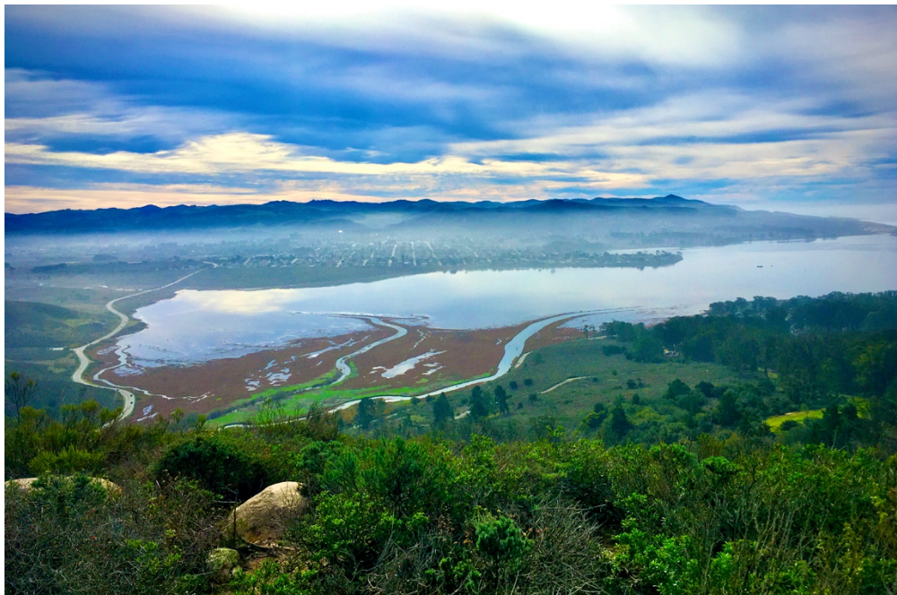
View from Black Mountain, between the rain storms.