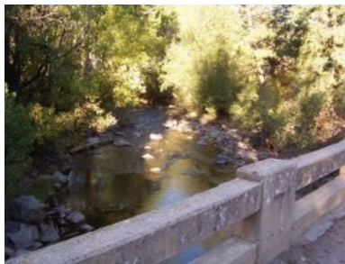
An old bridge over Boulder Creek along a trail paralleling Colorado State Highway 119 west of Boulder.