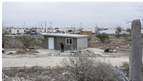
After house built