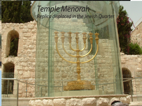
Temple Menorah Replica displaced in the Jewish Quarter