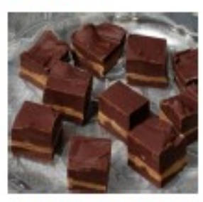
MAPLE RIBBON a ribbon of maple sandwiched between layers of dark chocolate