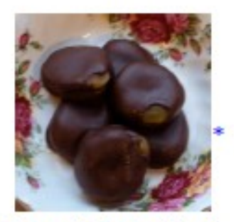
Chocolate Apricots for those who like their chocolate a little less rich (6 good-size dried apricots for $3)