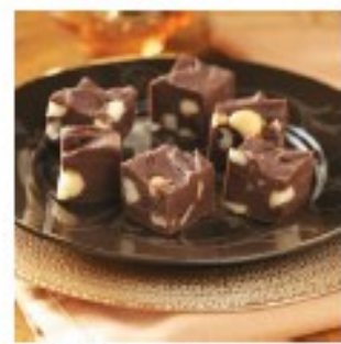
MACADAMIA MADNESS dark chocolate, macadamias Portion is a little smaller as the nuts are pricey