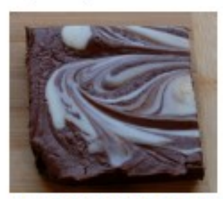
a very pretty fudge, decadent chocolate with the taste of Root Beer over ice cream!