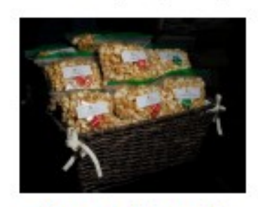
Caramel Corn & Caramel Corn Light full strength and a low calorie version (enough to fill a sandwich bag $3)