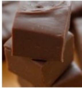
MIDNIGHT MINT silky dark chocolate with a hint of crème de menthe (no alchohol)