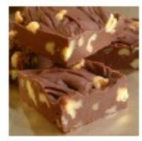
a softer, sweeter, more traditional fudge