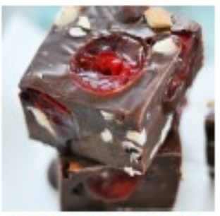
BLACK FOREST our best-seller, dark chocolate, cherries almonds

All Birthright Fudges* are $5 (each package = 1/4 of an 8 inch square pan).