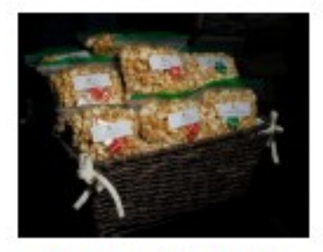
Caramel Corn & Caramel Corn Light full strength and a low calorie version (enough to fill a sandwich bag $3)