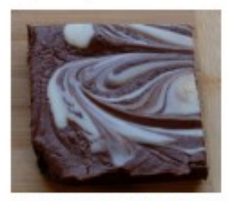
a very pretty fudge, decadent chocolate with the taste of Root Beer over ice cream!