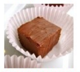
CLASSIC CHOCOLATE softer, sweeter, more traditional (no nuts ~ trace amounts may be present)