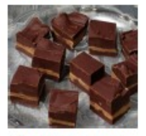
MAPLE RIBBON a ribbon of maple sandwiched between layers of dark chocolate