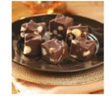
MACADAMIA MADNESS dark chocolate, macadamias Portion is a little smaller as the nuts are pricey