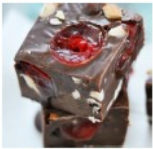
BLACK FOREST our best-seller, dark chocolate, cherries almonds

All Birthright Fudges* are $5 (each package = 1/4 of an 8 inch square pan).