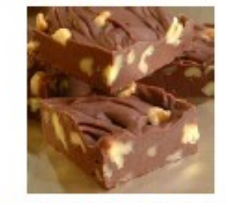
CHOCOLATE WALNUT a softer, sweeter, more traditional fudge