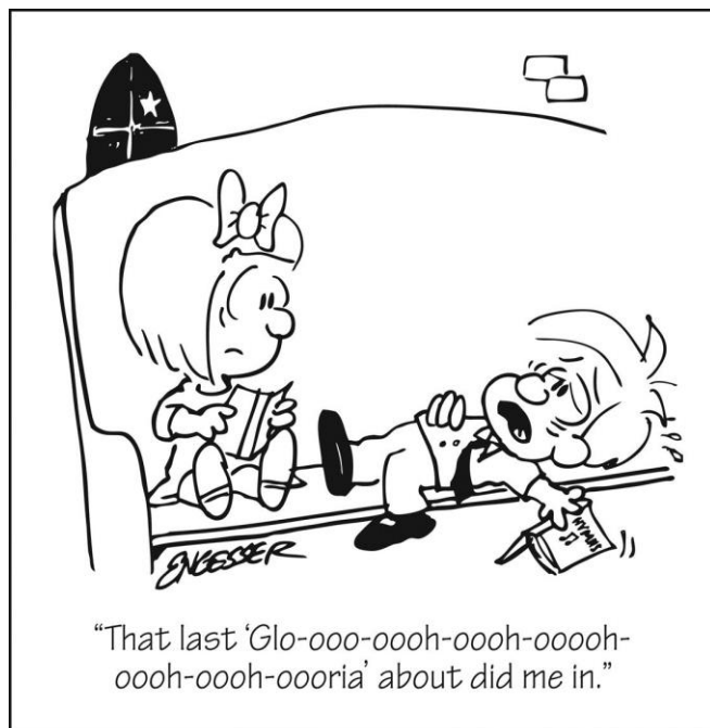
"That last 'Glo-ooo-oooh-oooh-oooh-oooh-oooh-oooh-oooria' about did me in."