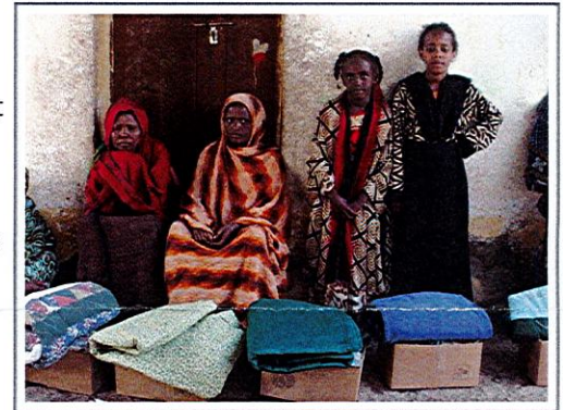
Families are provided food and blankets through Unto's critical aid program.