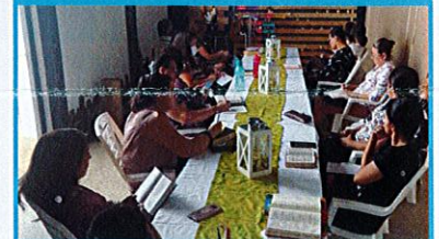
Bible study at a women's meeting