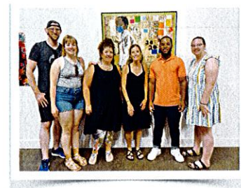
The Transform Arts team hosting an art opening

I had a warm welcome from my Transform Arts team and have already begun jumping in on hosting art events in KC and planning for the artist residency program in NYC. I am grateful that the Lord continues to give me a context in which to serve and use my gifts. Thanks for being so faithful to support me in this work of pursuing students' hearts!