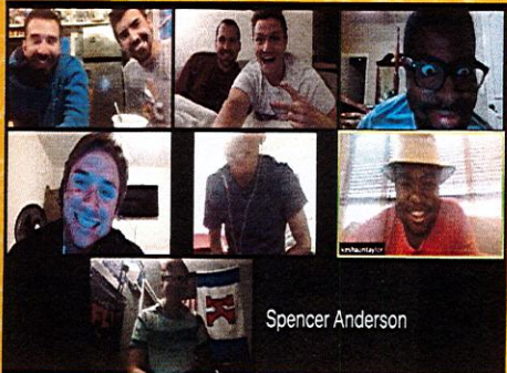
Our student leaders at KU also virtually worked through content to grow in leadership skills and biblical understanding this summer!