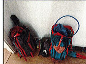
Top down: the Q summer projects logo (the shell is a symbol of the Camino de Santiago); a local hike with students; and our backpacks in process for the Camino.