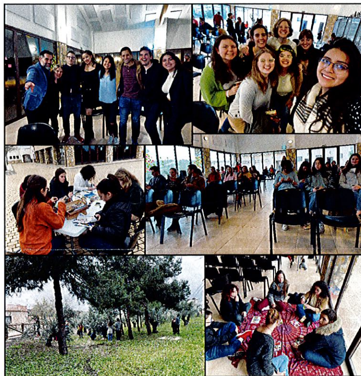
Pictures from the National Spring Q - Cristianos Universitarios Conference

Three significant things they did were: (1) surface students at UAM, a campus where we'd like to start a small group and grow Q, (2) start an