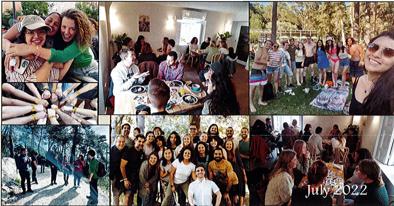
Clockwise from top left: Q Madrid students at a going away party for study abroad students, Q Brunch reflection time as we talked about essentials of the Christian faith with Christians and non-Christians, our end of the year pool celebration, Q Brunch, national Q staff with some students and volunteers at the national Cru conference, a Saturday hike in the mountains of Madrid, and hands and wristbands of students who went to the end of the year celebration.