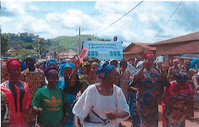
Parade with Scripture banner to celebrate the Toma Bible

The Lord answered so many prayers during the Toma Bible dedication in June. Here are some pictures to give you a taste!