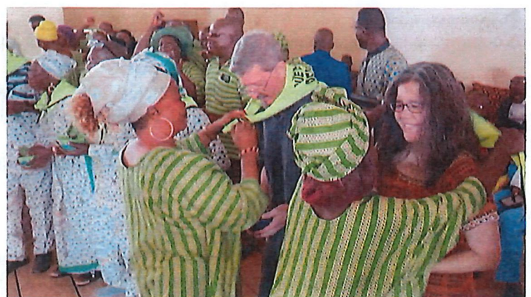
Receiving gifts during the dedication