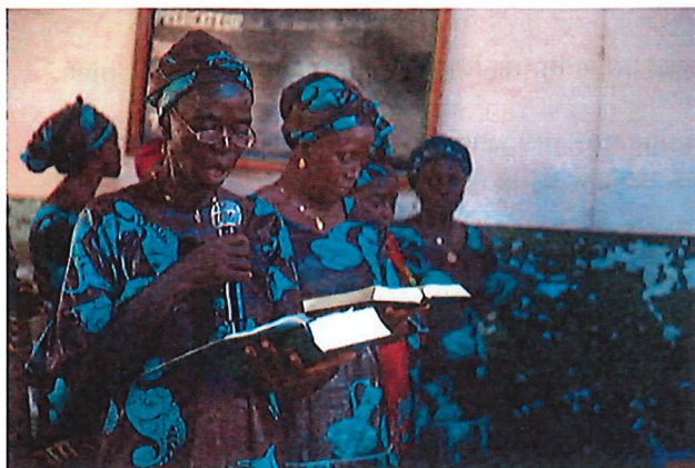
The first reading from the complete Toma Bible in church