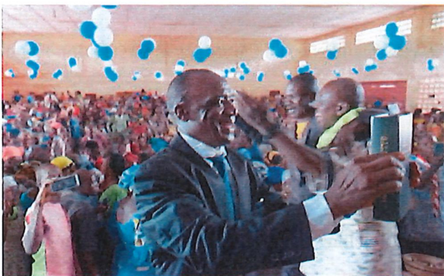
Unveiling the Toma Bible on dedication day