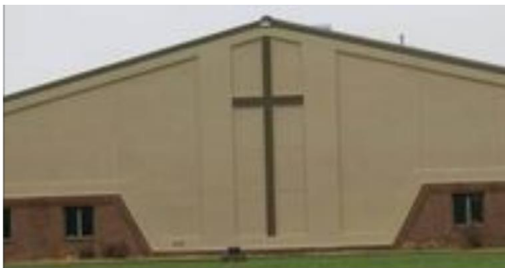
Grand Heights Baptist Church - www.facebook.com

https://www.facebook.com/GrandHeightsBaptistChurch/live_videos/