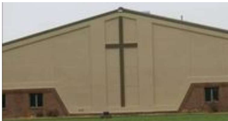
Grand Heights Baptist Church - www.facebook.com

https://www.facebook.com/GrandHeightsBaptistChurch/live_videos/