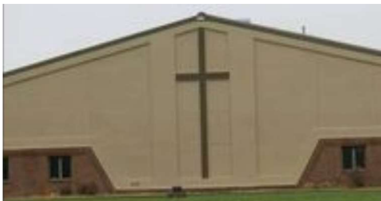
Grand Heights Baptist Church - www.facebook.com

https://www.facebook.com/GrandHeightsBaptistChurch/live_videos/