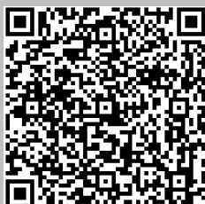
Holy Disciples Church

As we continue our annual focus on Stewardship of Treasure , we invite you to take a moment to reflect on the many ways God has blessed you financially over the past year.