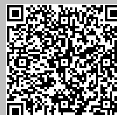
Our Lady of Good Counsel Church

As in previous years, your generous support directly sustains our mission and our ministries—helping one another encounter Jesus Christ in meaningful and transformative ways.