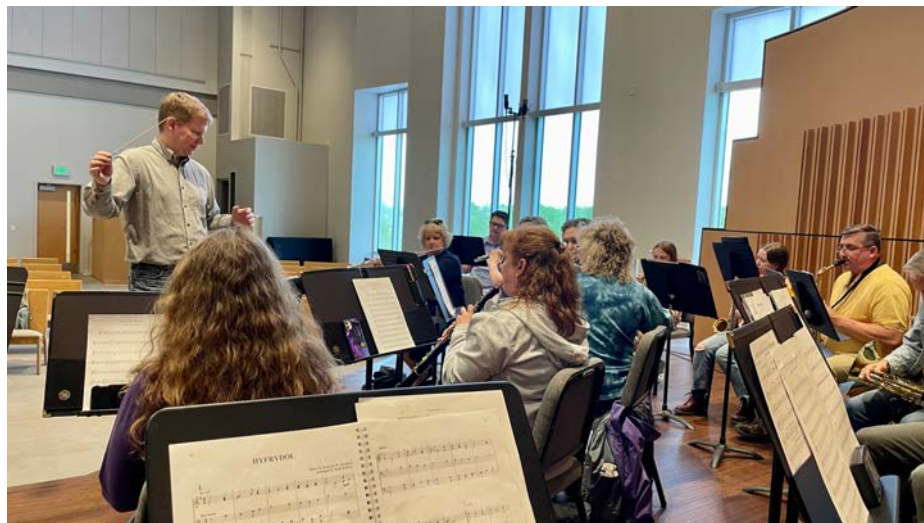
St. Andrew's Wind Ensemble practices for the worship service on Sunday May 21, 2023.

We're fortunate that many singers, ringers, and other instrumentalists want to continue making music during the summer on a limited basis. These creative endeavors are made possible through the dedicated, talented, and forward-thinking people at St. Andrew. We hope that you find renewal, rejuvenation, and connection with God during these experiences over the summer.