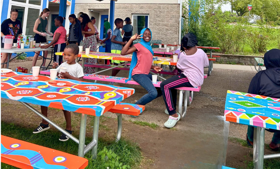
St. Andrew members help strengthen local food security through (from upper left clockwise) partnerships with Health Kids Iowa and HACAP, the Summer Lunch Bunch, harvesting with Fields of Faith, and monthly hosting at the Iowa City Free Lunch program.