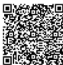
QR Code for visitors

VISITORS: We are delighted that you have chosen to worship with us today! So that we might begin to be in a Christian relationship with you, we encourage you to register your attendance (1) by using your phone to scan the QR code below and provide your email, phone number, and/or home address, or (2) by completing a Visitor's Card located on the back of the pew in front of you and placing it in the offering plate. Thank you - we look forward to seeing you again soon!