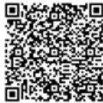
QR Code for visitors

VISITORS: We are delighted that you have chosen to worship with us today! So that we might begin to be in a Christian relationship with you, we encourage you to register your attendance (1) by using your phone to scan the QR code below and provide your email, phone number, and/or home address, or (2) by completing a Visitor's Card located on the back of the pew in front of you and placing it in the offering plate. Thank you - we look forward to seeing you again soon!