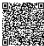
QR Code for visitors

VISITORS: We are delighted that you have chosen to worship with us today! So that we might begin to be in a Christian relationship with you, we encourage you to register your attendance (1) by using your phone to scan the QR code below and provide your email, phone number, and/or home address, or (2) by completing a Visitor's Card located on the back of the pew in front of you and placing it in the offering plate. Thank you - we look forward to seeing you again soon!