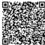
QR Code for visitors

VISITORS: We are delighted that you have chosen to worship with us today! So that we might begin to be in a Christian relationship with you, we encourage you to register your attendance (1) by using your phone to scan the QR code below and provide your email, phone number, and/or home address, or (2) by completing a Visitor's Card located on the back of the pew in front of you and placing it in the offering plate. Thank you - we look forward to seeing you again soon!