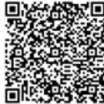
QR Code for visitors

VISITORS: We are delighted that you have chosen to worship with us today! So that we might begin to be in a Christian relationship with you, we encourage you to register your attendance (1) by using your phone to scan the QR code below and provide your email, phone number, and/or home address, or (2) by completing a Visitor's Card located on the back of the pew in front of you and placing it in the offering plate. Thank you - we look forward to seeing you again soon!