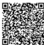
QR Code for visitors

in a Christian relationship with you, we encourage you to register your attendance (1) by using your phone to scan the QR code below and provide your email, phone number, and/or home address, or (2) by completing a Visitor's Card located on the back of the pew in front of you and placing it in the offering plate. Thank you—we look forward to seeing you again soon!