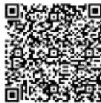
QR Code for visitors

VISITORS: We are delighted that you have chosen to worship with us today! So that we might begin to be in a Christian relationship with you, we encourage you to register your attendance (1) by using your phone to scan the QR code below and provide your email, phone number, and/or home address, or (2) by completing a Visitor’s Card located on the back of the pew in front of you and placing it in the offering plate. Thank you—we look forward to seeing you again soon!