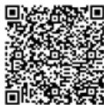
QR Code for visitors

in a Christian relationship with you, we encourage you to register your attendance (1) by using your phone to scan the QR code below and provide your email, phone number, and/or home address, or (2) by completing a Visitor's Card located on the back of the pew in front of you and placing it in the offering plate. Thank you - we look forward to seeing you again soon!