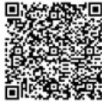
QR Code for visitors

VISITORS: We are delighted that you have chosen to worship with us today! So that we might begin to be in a Christian relationship with you, we encourage you to register your attendance (1) by using your phone to scan the QR code below and provide your email, phone number, and/or home address, or (2) by completing a Visitor's Card located on the back of the pew in front of you and placing it in the offering plate. Thank you - we look forward to seeing you again soon!