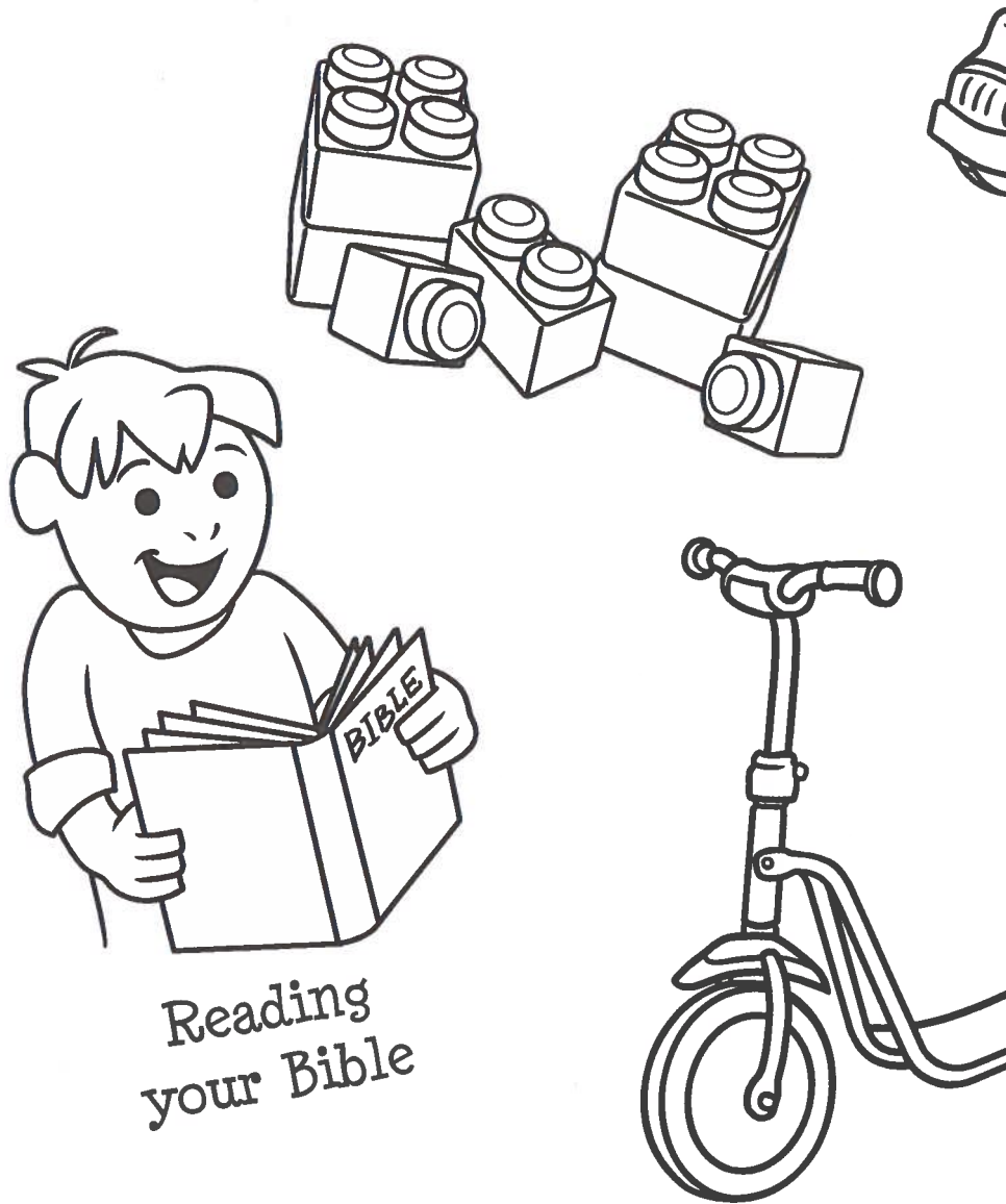
Reading your Bible

Jesus said the greatest commandment is to love God with all our heart, soul, and mind. The things that are important to God should become more important to us as we follow Him each day. Put a circle around the things that are important parts of loving God. Then color the pictures.