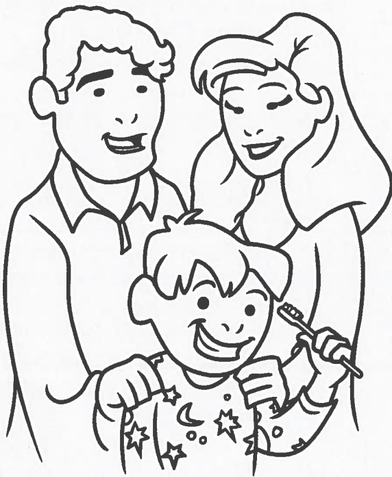
Obeying Mom and Dad

Yes. Be careful your heart is not putting your new bike before Jesus! Jesus should always be your first love!