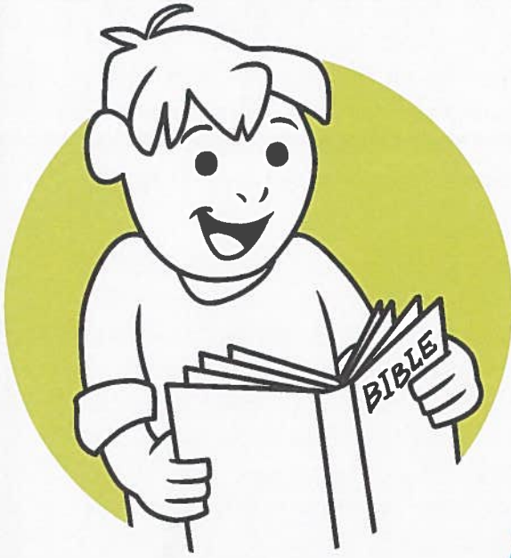
Read the Bible.

It is important to honor God! Color the pictures below.