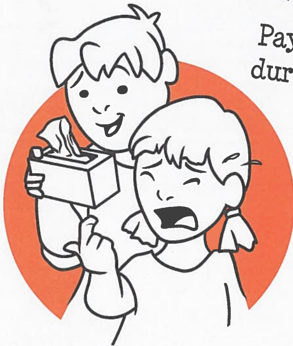
Help others cheerfully.