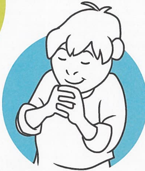
Pay attention during prayer.