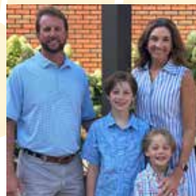
The Killen Family