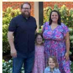
The Jopling Family