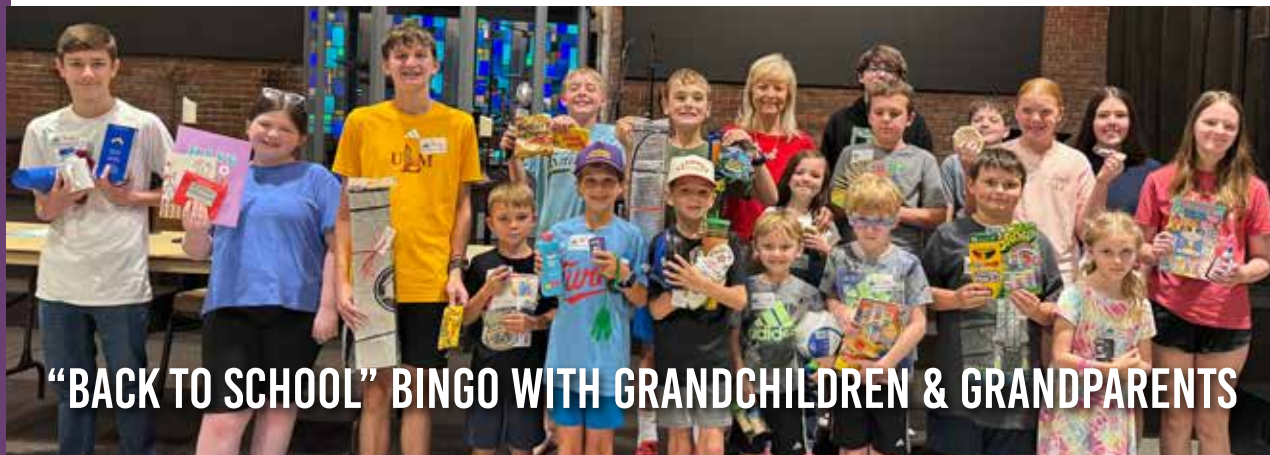
"BACK TO SCHOOL" BINGO WITH GRANDCHILDREN & GRANDPARENTS

LUNCH AND LISTEN: "BROWN BAG CONCERT" - Join us Wednesday, September 24, at noon at the gazebo behind the West Monroe Farmer's Market, 1800 N. 7th Street. Bring a brown bag lunch or treat yourself to a $6 box lunch with tea available on site from Newk's Eatery.