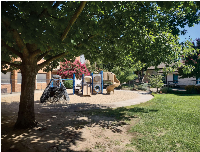
Fremont Nursery School's playground is just outside the classrooms.

Fremont believes that the preschool years are critical for a child's social, intellectual, emotional, physical and spiritual growth. These fundamental skills are important for success in both school and life. Our caring staff facilitates endless opportunities for children to think, explore and grow in a hands-on, multi-sensory environment. We provide an age appropriate, comprehensive program with meaningful learning in all developmental areas. Our school provides abundant enrichment opportunities for the whole child. Our goal is to provide a safe and nurturing Christian environment where students can grow at their own developmental level within a well-rounded, play based and thematic curriculum.