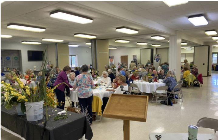
District 5 Garden Club Fall Meeting