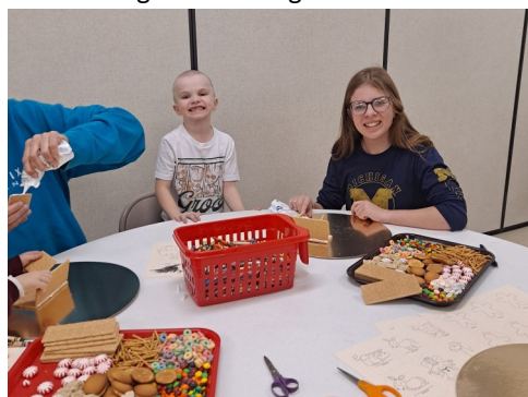
Parents' Night Out - Gingerbread Bash