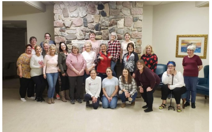
Ladies Line Dancing