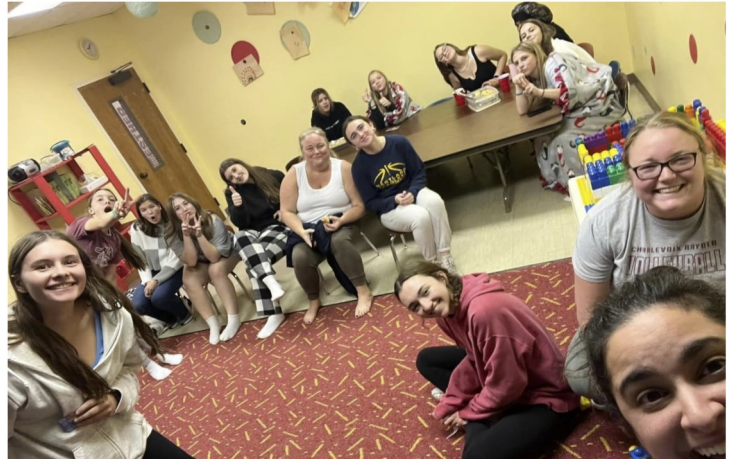
Charlevoix J.V. Volleyball Team Sleepover