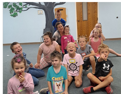
Crazy Hair Night - Wednesday CRC Kids

Children's Ministry had a busy and fun year. Along with our weekly Sunday school and Wednesday night activities we hosted a handful of special events like Parents Night Out with a Gingerbread Bash theme. We also hosted Vacation Bible School in August that had a fantastic turn out, and held our biggest and best Trunk-or-Treat yet this fall. CRC Kids ended the year with an amazing Christmas Program.