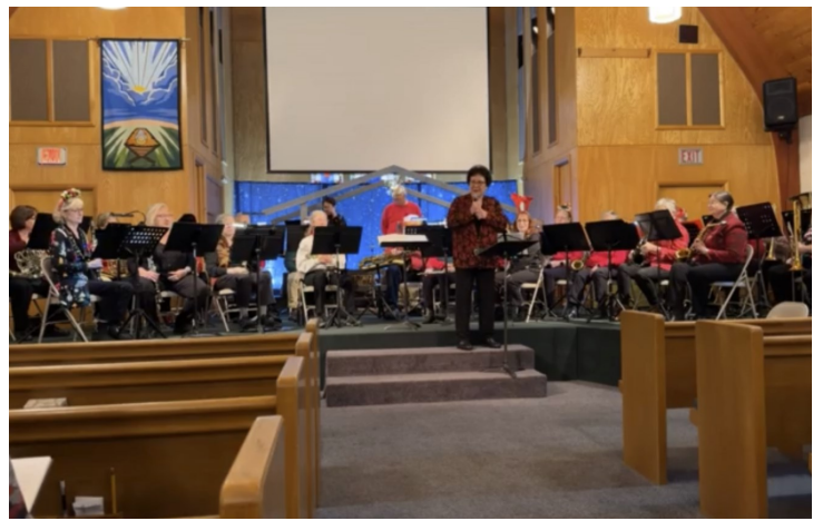
Pine Lake Winds Christmas Concert