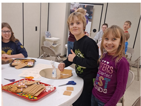
Parents' Night Out - Gingerbread Bash