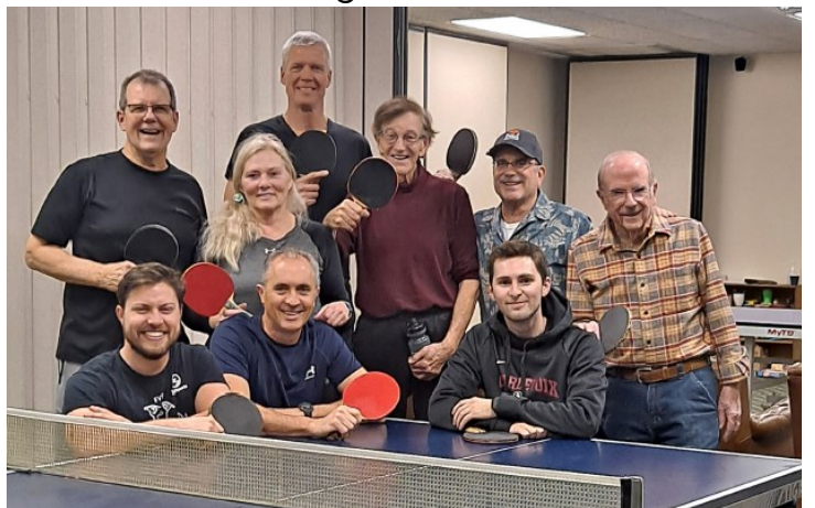
Weekly Ping Pong