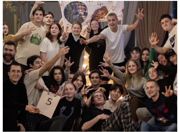
Young Life Moldova