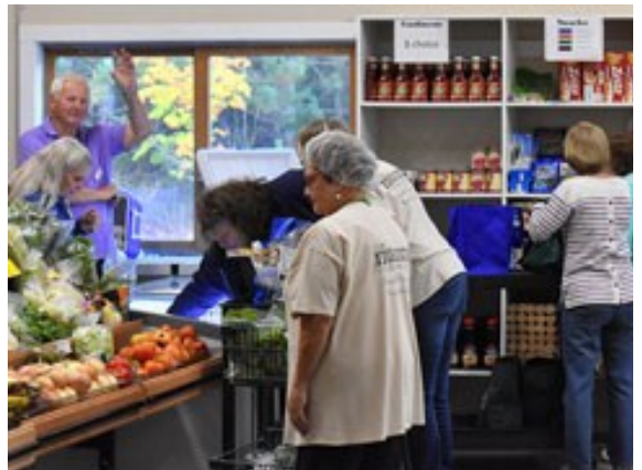
Manna Food Project