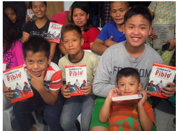
Bible League International