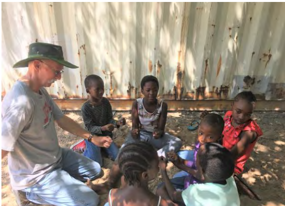
Playing a game with COP kids

and some finishing touches to the COP office prior to the group's visit. As part of Team Botswana, we also helped transport the group and watched