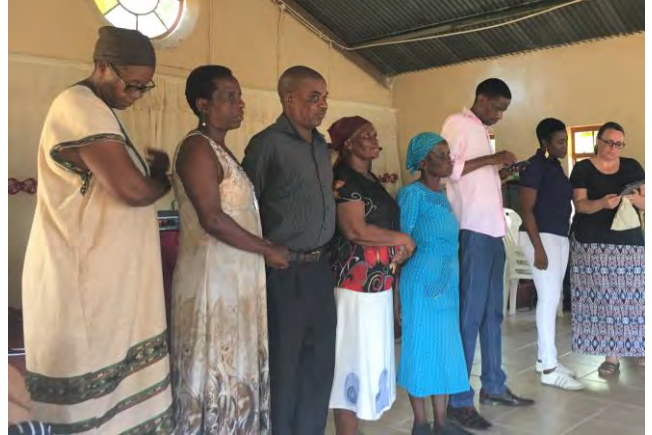
(Top) Interviewing a COP child