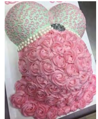
"Interesting" range of baby shower cake ideas