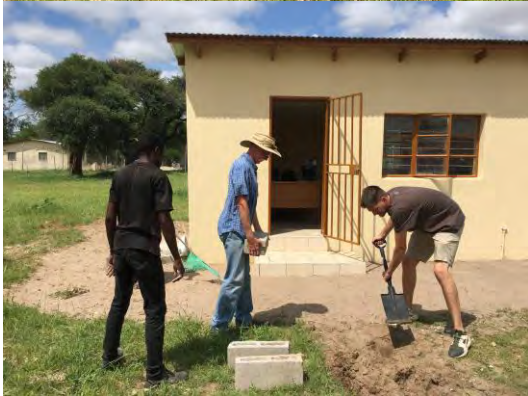
COP office and grounds preparation