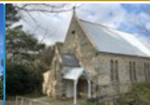
Our Lady of the Rosary Stirling