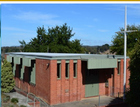
St Joseph's Lobethal