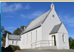
St Matthew's Birdwood