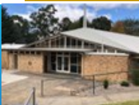
St Matthew's Bridgewater