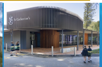
St Catherine's Stirling