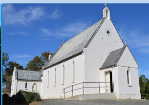
St Matthew's Birdwood