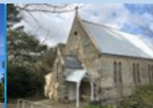
Our Lady of the Rosary Stirling