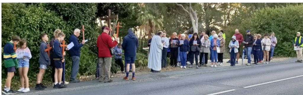
Birdwood parishioners supported many parish celebrations, among the April Way of the Cross pilgrimage in Stirling