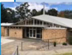
St Matthew's Bridgewater