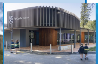
St Catherine's Stirling