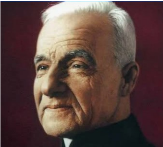
Saint André Bessette