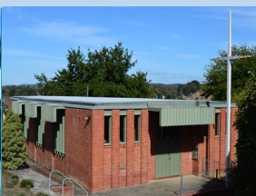
St Joseph's Lobethal