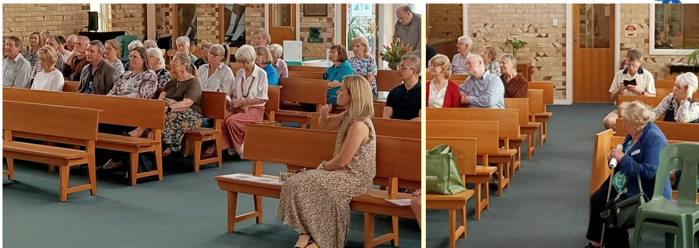
Just some of the more than 60 parishioners who attended the Parish Assembly on 19 October