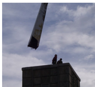
An historic moment February 25, 2008