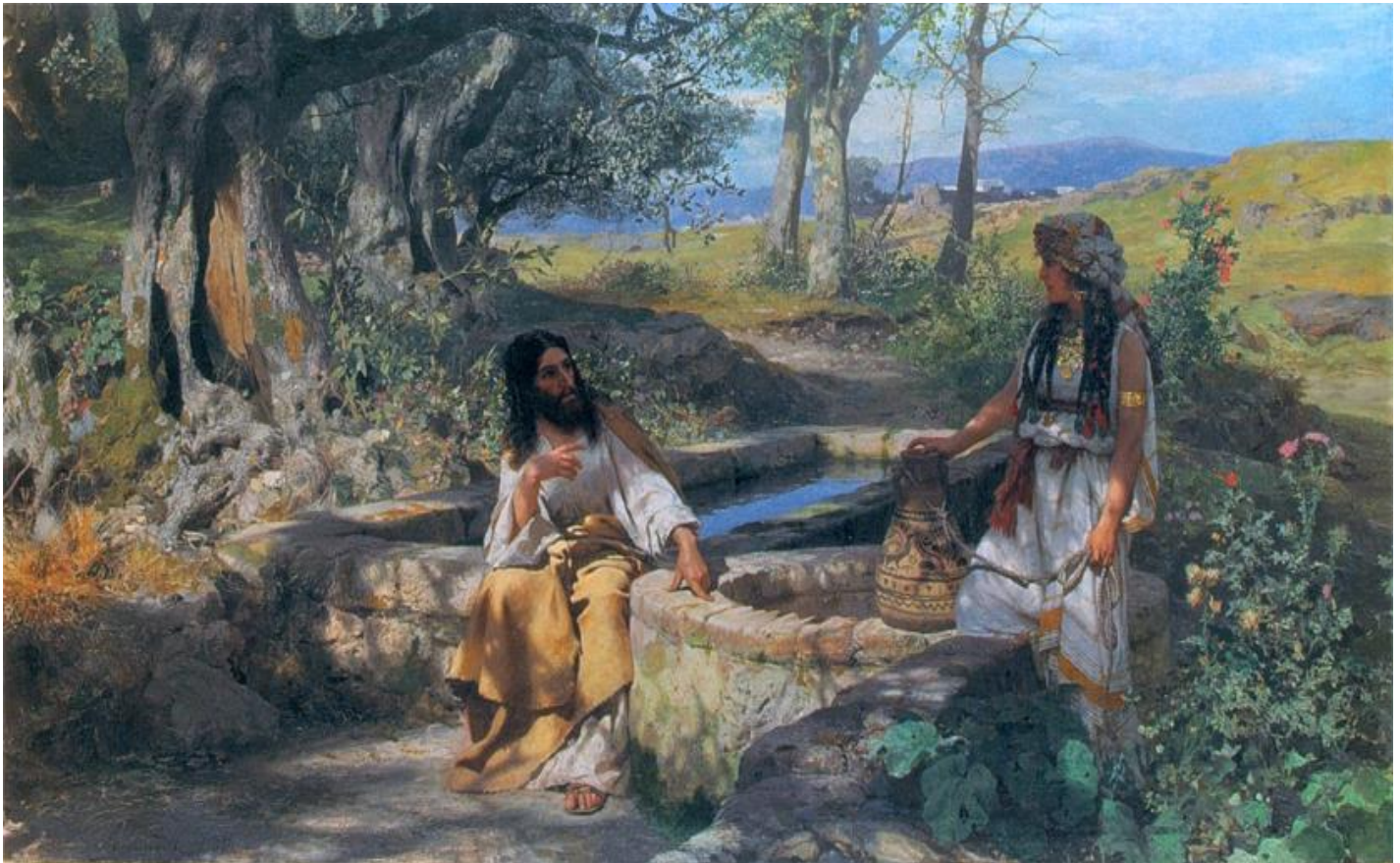
Christ and the Samaritan Woman Henryk Siemiradzki 1890

I was glad when they said to me, "Let us go to the house of the Lord"