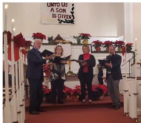
9 PM Christmas Eve Special Music