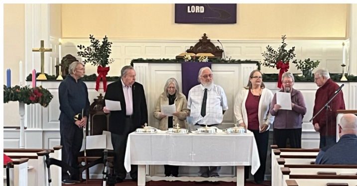
Advent Week 1: The Bible Study Class