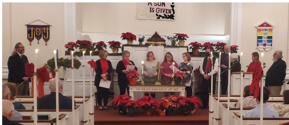
Advent Week 4: 9 PM—The CFC Choir