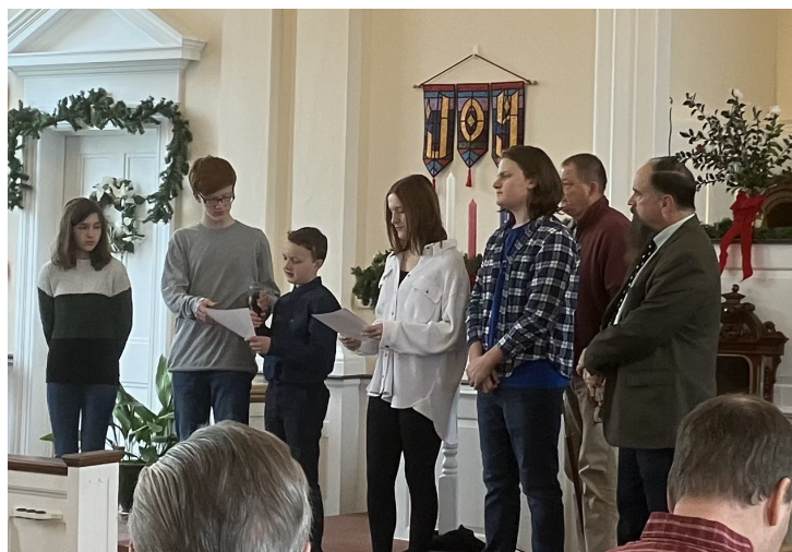
Advent Week 3: The Discipleship Class