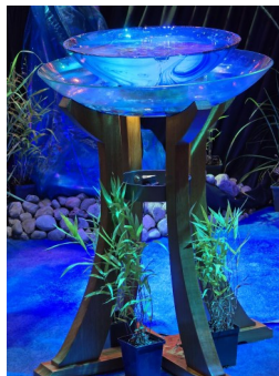
Synod Baptismal Font