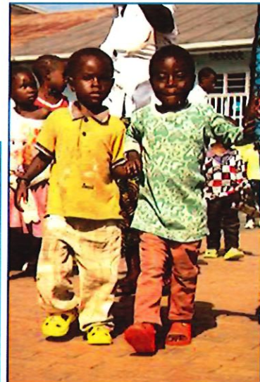
Provided shoes for 1367 Sunday School students on Christmas Day