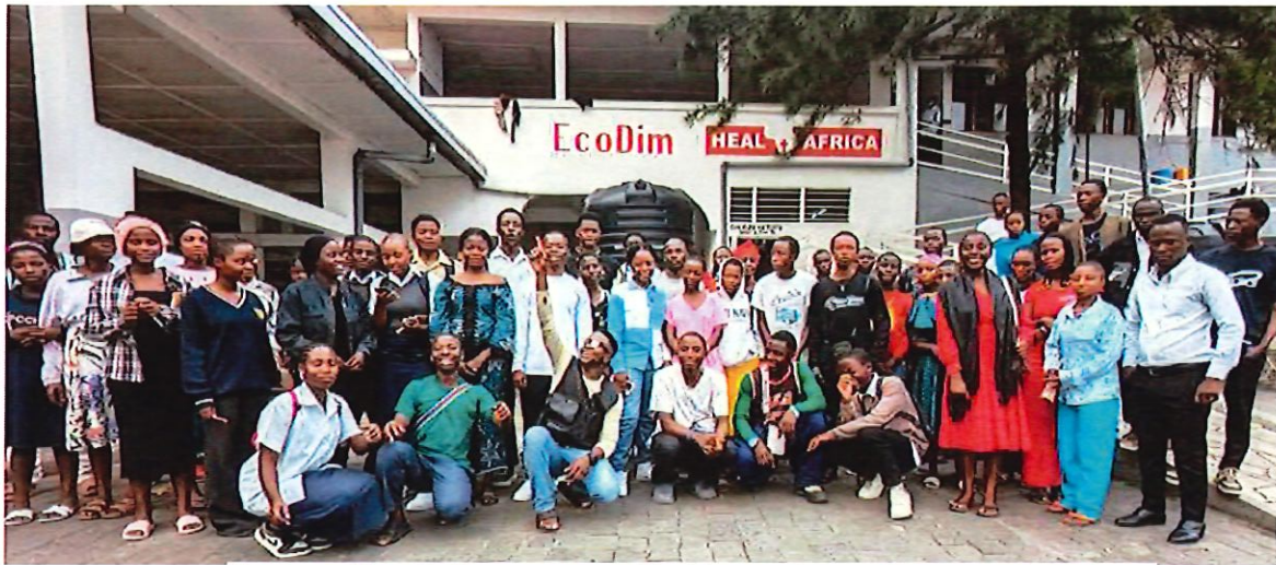
Our new Youth Group started in November and grew quickly!