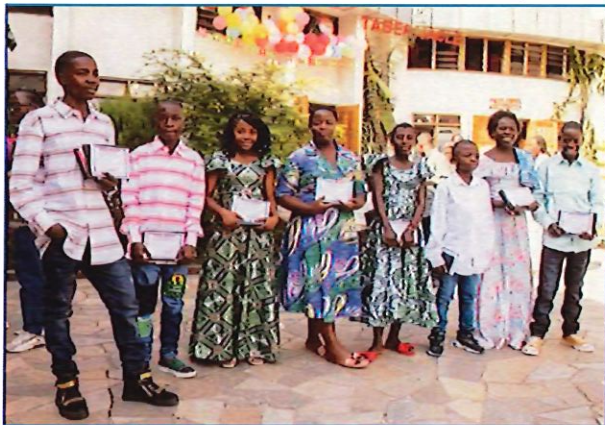
Eight Youth Baptisms on Christmas Day