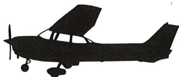
Kodiak (pun intended) in PNG