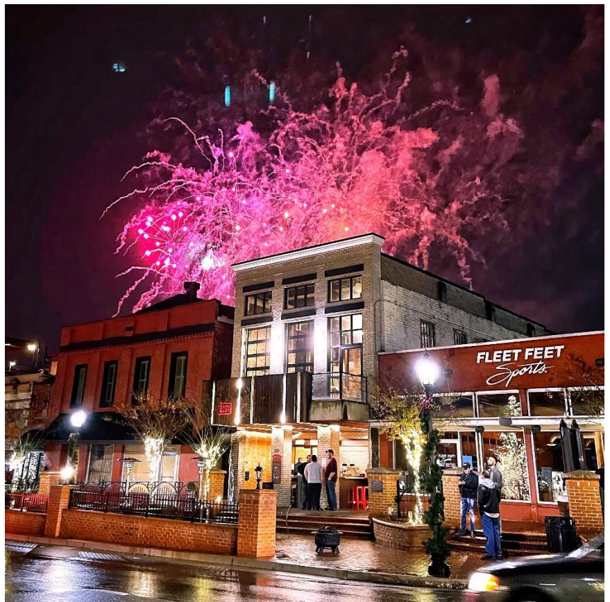
Fireworks on the Downtown Square.