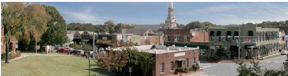
Lawrenceville Historic Square