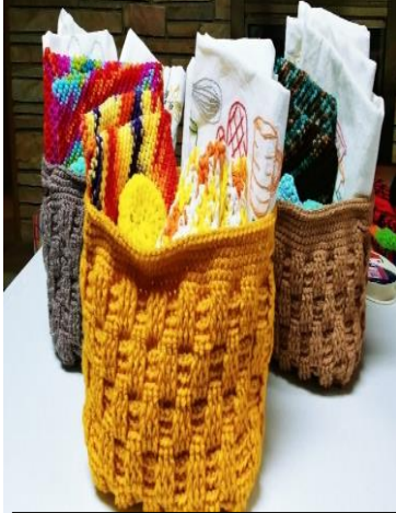
Gift baskets with kitchen items $25

Crafters Chances to win one of two quilts | drawing will be December 1 st | Quilts on display in the south entry | purchase tickets from any of the Crafters | proceeds from the ticket sales go toward paying off the construction costs for the addition on the church. | contact person Connie Meyer at 913-909-7164