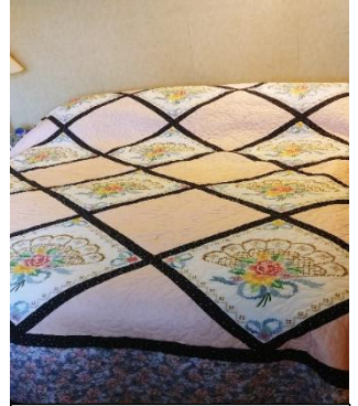
Queen/King quilt, 96 x 110 inches

Crafters Chances to win one of two quilts | drawing will be December 1 st | Quilts on display in the south entry | purchase tickets from any of the Crafters | proceeds from the ticket sales go toward paying off the construction costs for the addition on the church. | contact person Connie Meyer at 913-909-7164