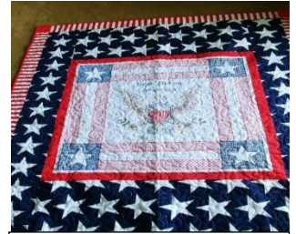
Patriotic lap quilt, 60 x 70 inches

Crafters Christmas Craft Sale | FCC's Family Life Center | drawing will be December 1 st , 2018 | all proceeds from the handmade items sold are donated back to the church or other charitable organizations.