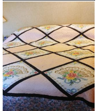
Queen/King quilt, 96 x 110 inches

Crafters Chances to win one of two quilts | drawing will be December 1 st | Quilts on display in the south entry | purchase tickets from any of the Crafters | proceeds from the ticket sales go toward paying off the construction costs for the addition on the church. | contact person Connie Meyer at 913-909-7164