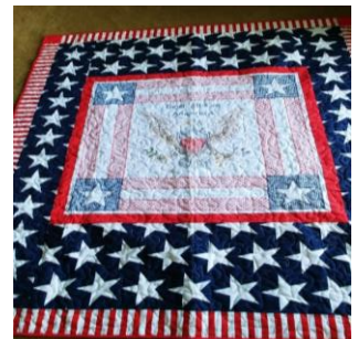
Patriotic lap quilt, 60 x 70 inches

Crafters Christmas Craft Sale | FCC's Family Life Center | drawing will be December 1 st , 2018 | all proceeds from the handmade items sold are donated back to the church or other charitable organizations.