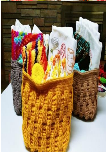
Gift baskets with kitchen items $25

NOTE: If you are interested in joining the Christian Crafters, they meet in the Annex on Thursday's from 10:00 a.m. until noon weekly. They would love to have you join them.