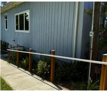
New side walk & rail