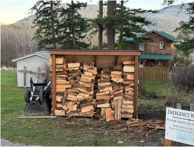
New wood shed.

Mission statement: To be good stewards of the beautiful worship and gathering space that God is blessing us with so that we can accomplish His mission in our community and the world. Our focus is safety and making improvements to better serve our Orcas community.