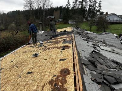
Roof by Johnson Roofing